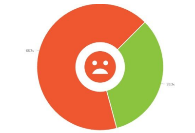
Pence: 67% Negative

Vice-Presidential Debate Reactions: While Pence mentions were at a 3:1 ratio compared to those referencing Kaine, the candidates were viewed in an equally negative light.