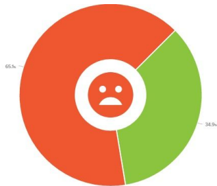
Clinton: 65% Negative

Both Presidential candidates saw negative mentions that were closely aligned with their representative VP candidates sentiments