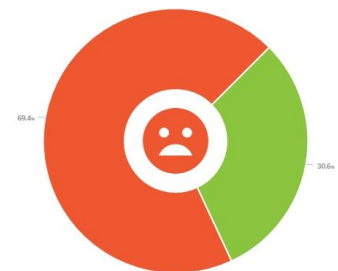
Trump: 70% Negative

Both Presidential candidates saw negative mentions that were closely aligned with their representative VP candidates sentiments